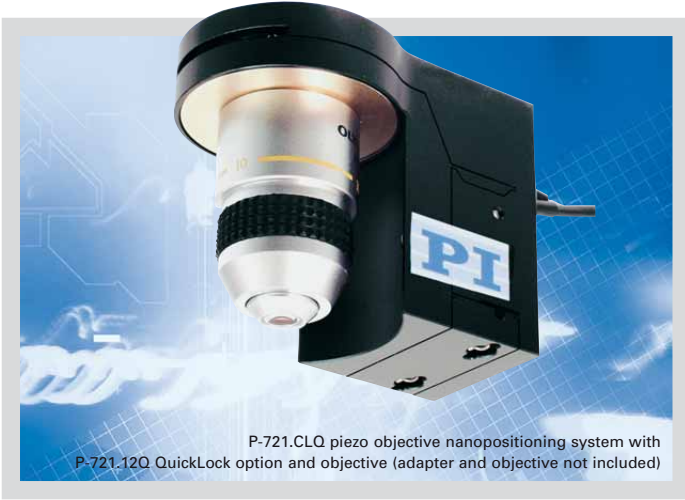
P-721.CLQ piezo objective nanopositioning system with P-721.12Q QuickLock option and objective (adapter and objective not included)